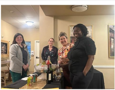
Sip and Paint