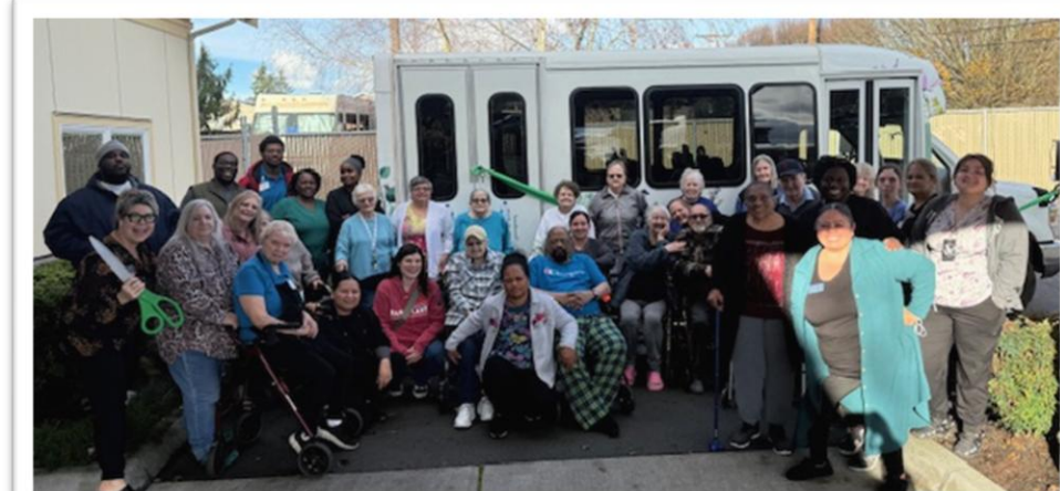
Ribbon Cutting for our new Bus