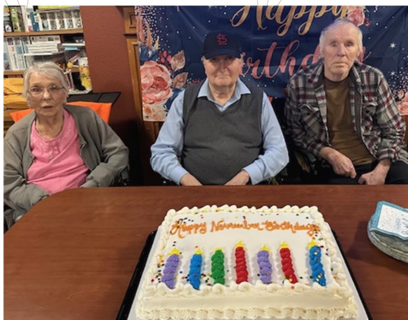
November Birthday Celebration