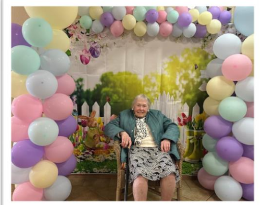
Service Saturday was Eggcellent!