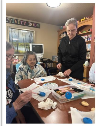
Earth Day arts & crafts