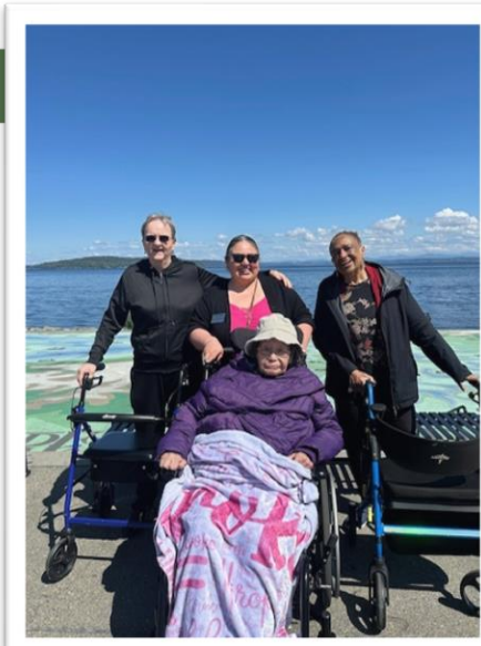
Walk at Point Ruston & Ice Cream